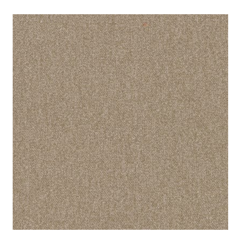
Theory 6142 $27.00 /yd. $25.20/yd for orders over 100 yards