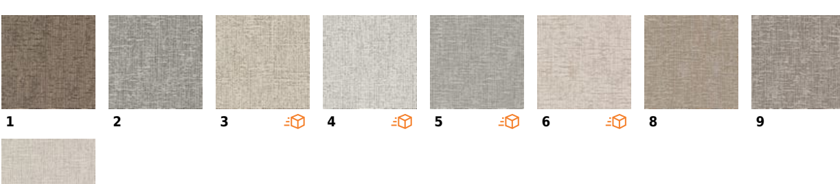
Select colors ship from NY in 15 business days, up to 300 yards