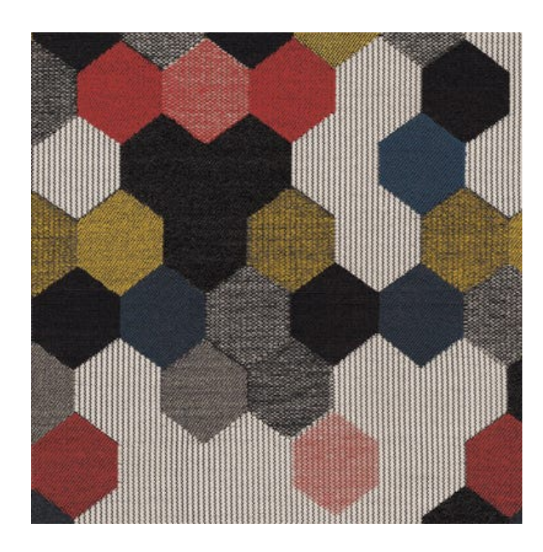
Maxwell Print 6380 $79.00 /yd.