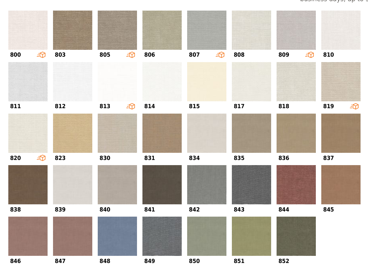
≟♥ Quick Ship Select colors ship from NY in 15 business days, up to 300 yards