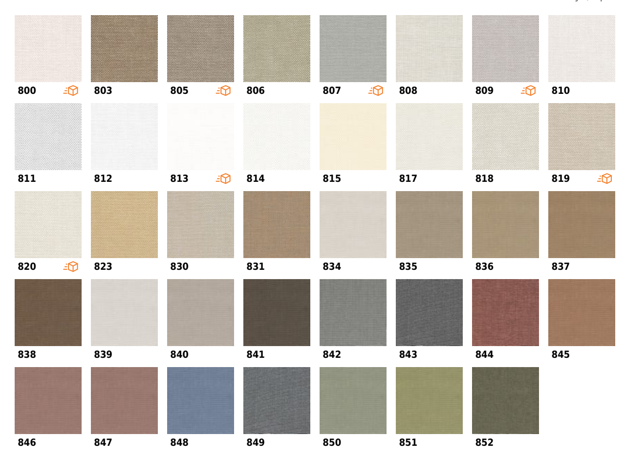
≟ ♡ Quick Ship Select colors ship from NY in 15 business days, up to 300 yards