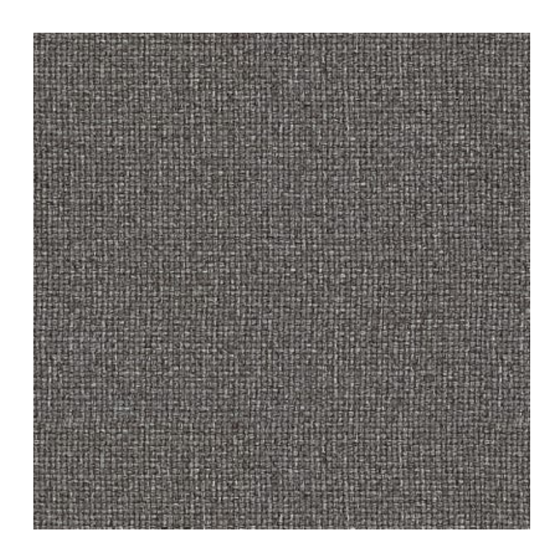
Hashtag 6478 /yd.