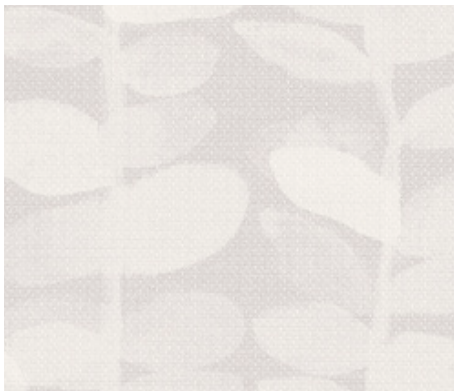
Shown on front 10

CONTENTS TPO Technology - 90% Thermoplastic Olefin 10% Post Consumer Recycled Glass