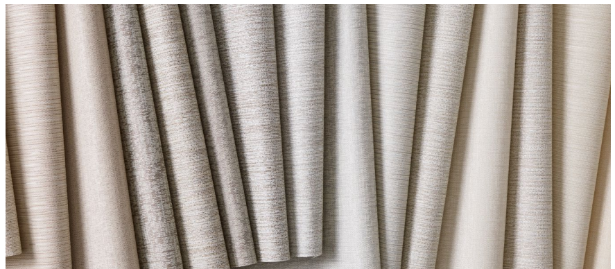
Xorel Cruise, which is made from a solution-dyed woven yarn, gained IMO certification in 2024

As part of the Xorel Cruise development process, Carnegie sought input from many creatives, including from the interior design team at Holland America Line and designers at firms specialising in cruise ship interiors.