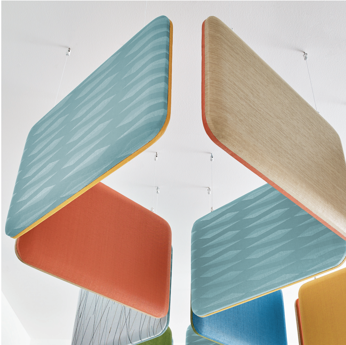
Flip Baffle in size large Fabrics on baffles: Arrow 6031 color 5; Dash 6603 color 28; Meteor 6427 colors 714, 719, 726, 731 and 739; Sleet Embroider 6299 color 809