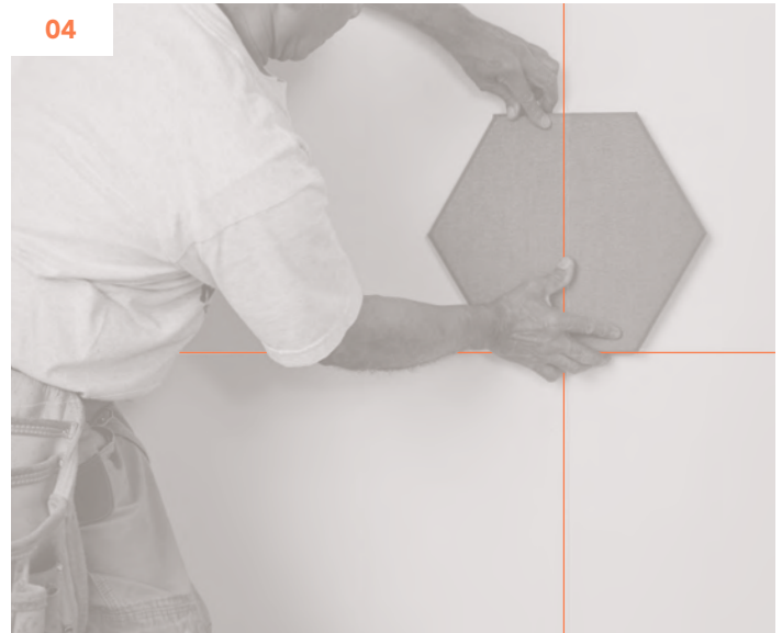
Match the center point of the panel with the center point of the wall, and apply the panel to the wall.