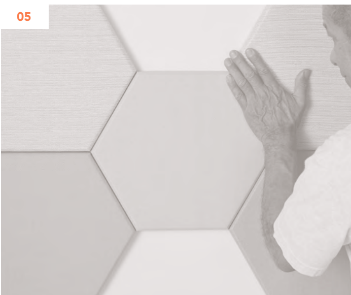
Apply pressure to the sides of the panel to make sure the panel is secure. As you install additional panels, interlock each panel to minimize gaps.