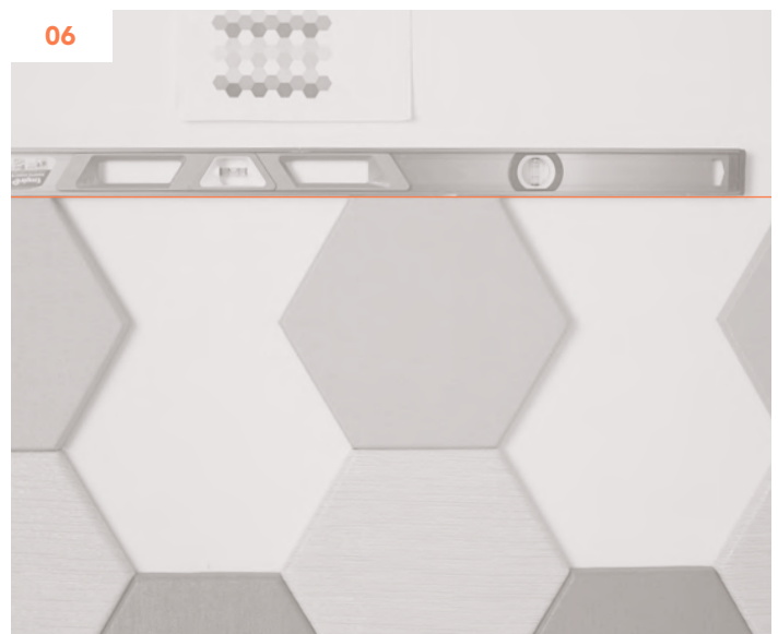
Once multiple panels are installed, make sure they are level and square using a level or laser.