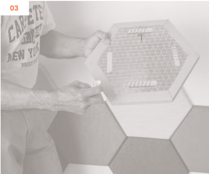
Remove the backing from each Command strip.