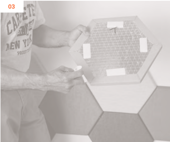
03 Remove the tape from the Velcro.