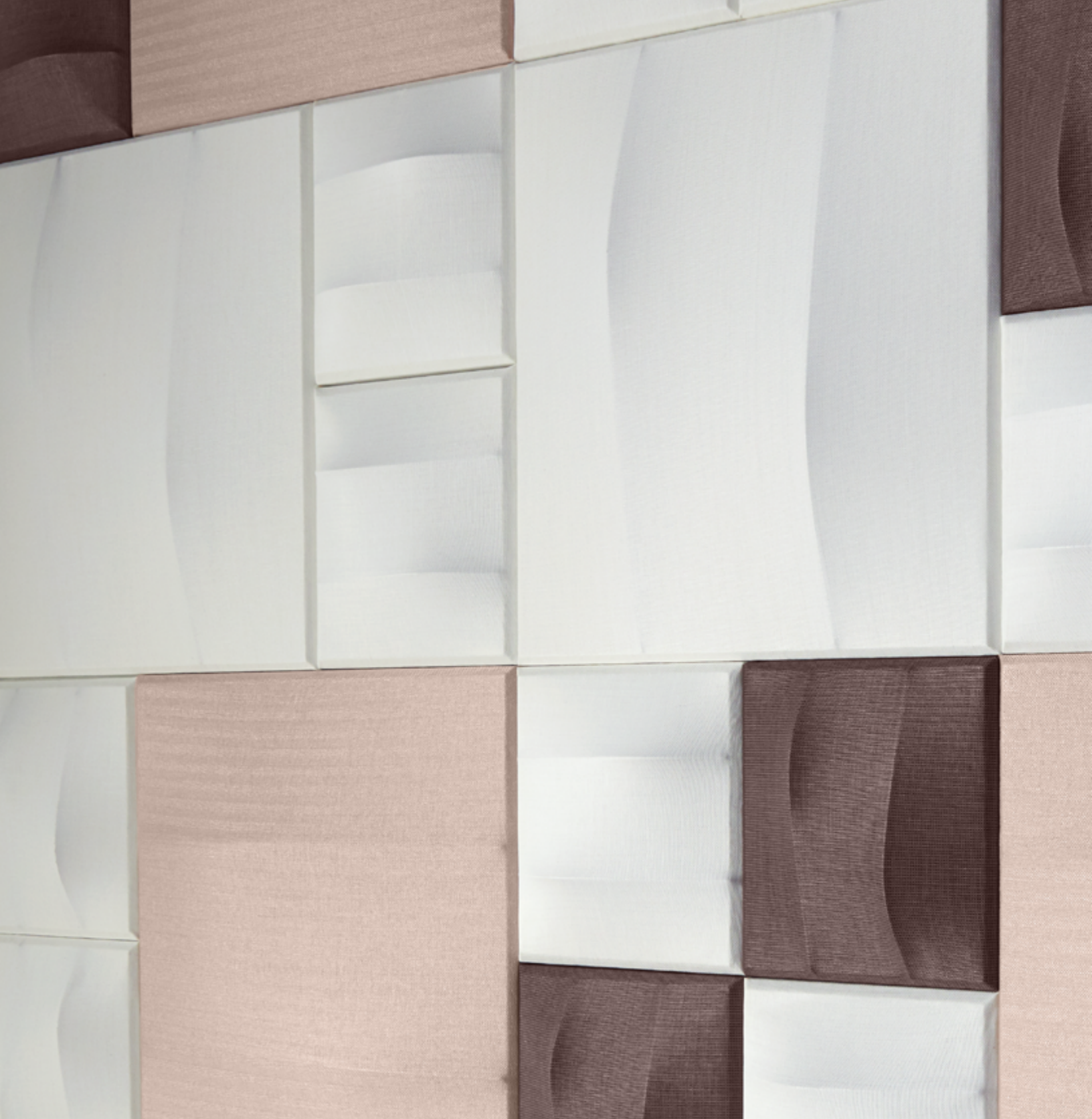
Range 3D Tiles in Ion 6151 color 34, Sahara Matte 6089 colors 602 and 621