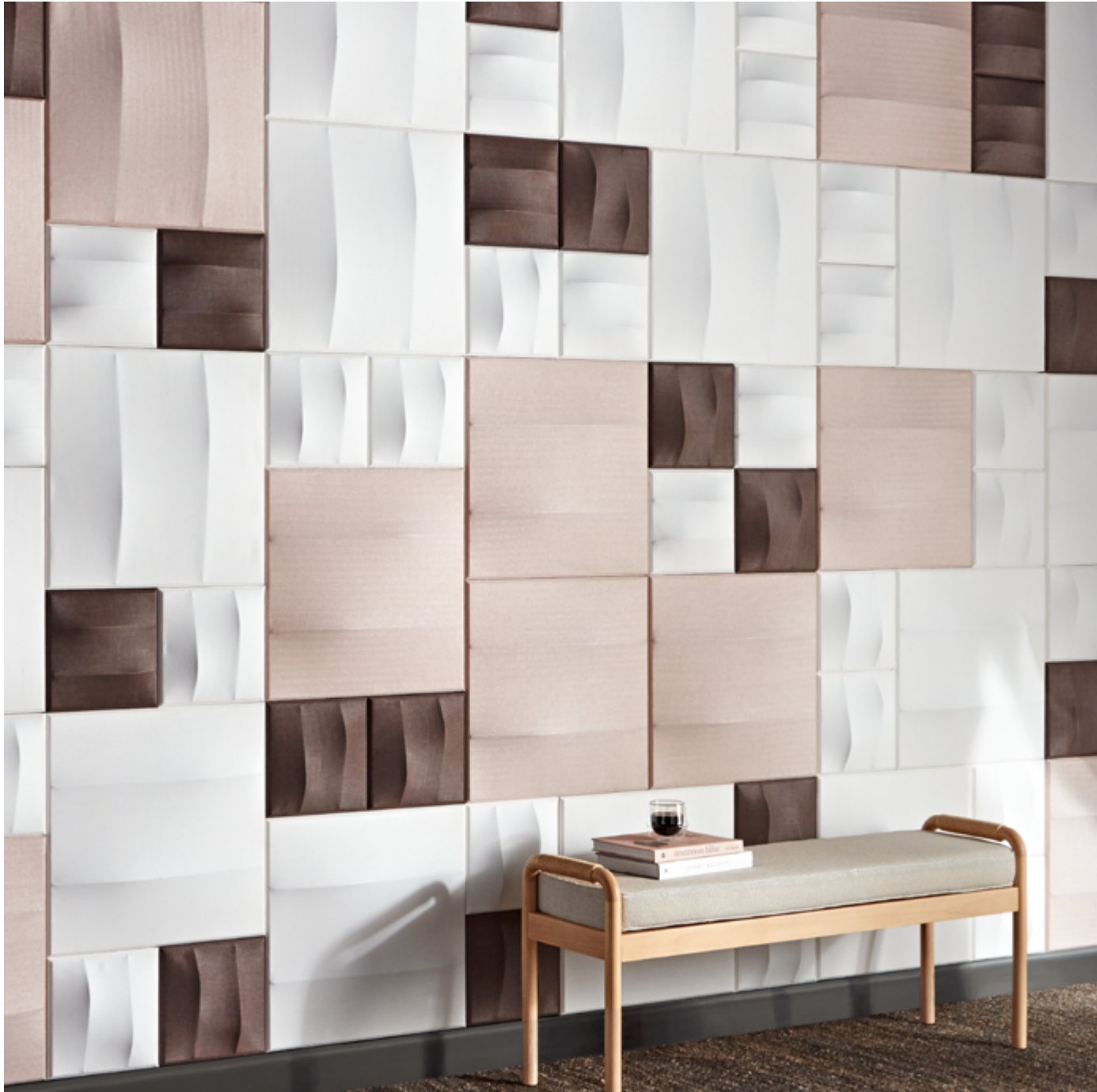
Range 3D Tiles in Ion 6151 color 34, Sahara Matte 6089 colors 602 and 621